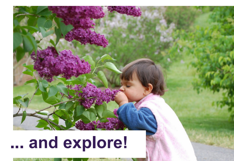
... and explore!