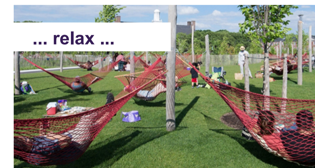
... relax ...