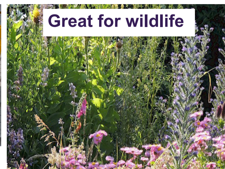
Great for wildlife