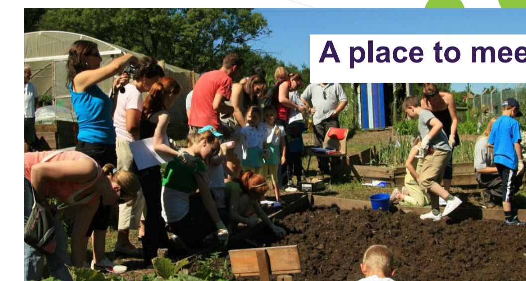
A place to meet ...