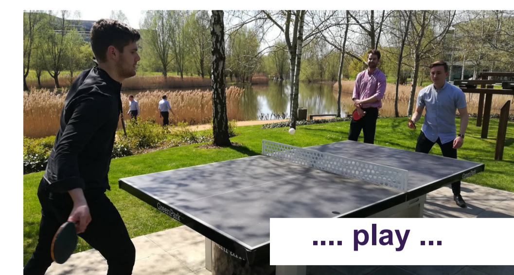
.... play ...