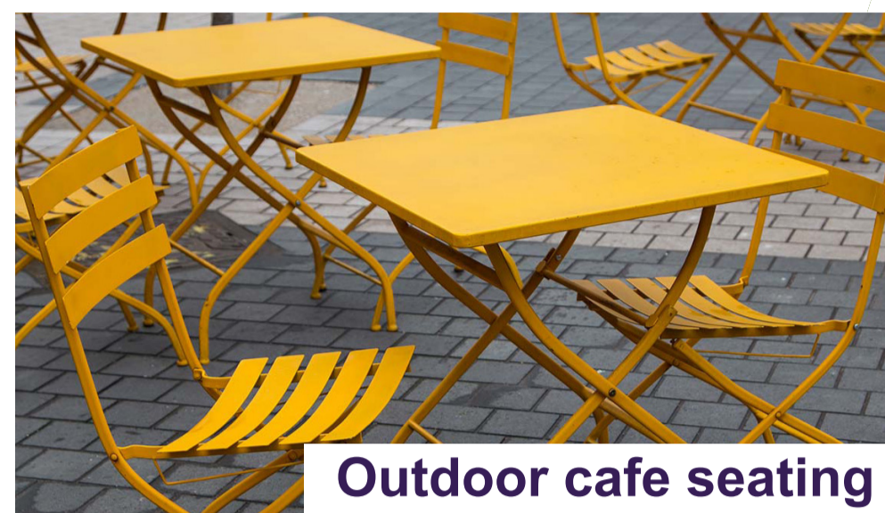
Outdoor cafe seating