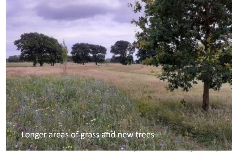
Longer areas of grass and new trees